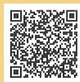
How to apply for the NHI card