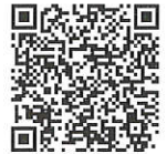
How to enroll for the NHI